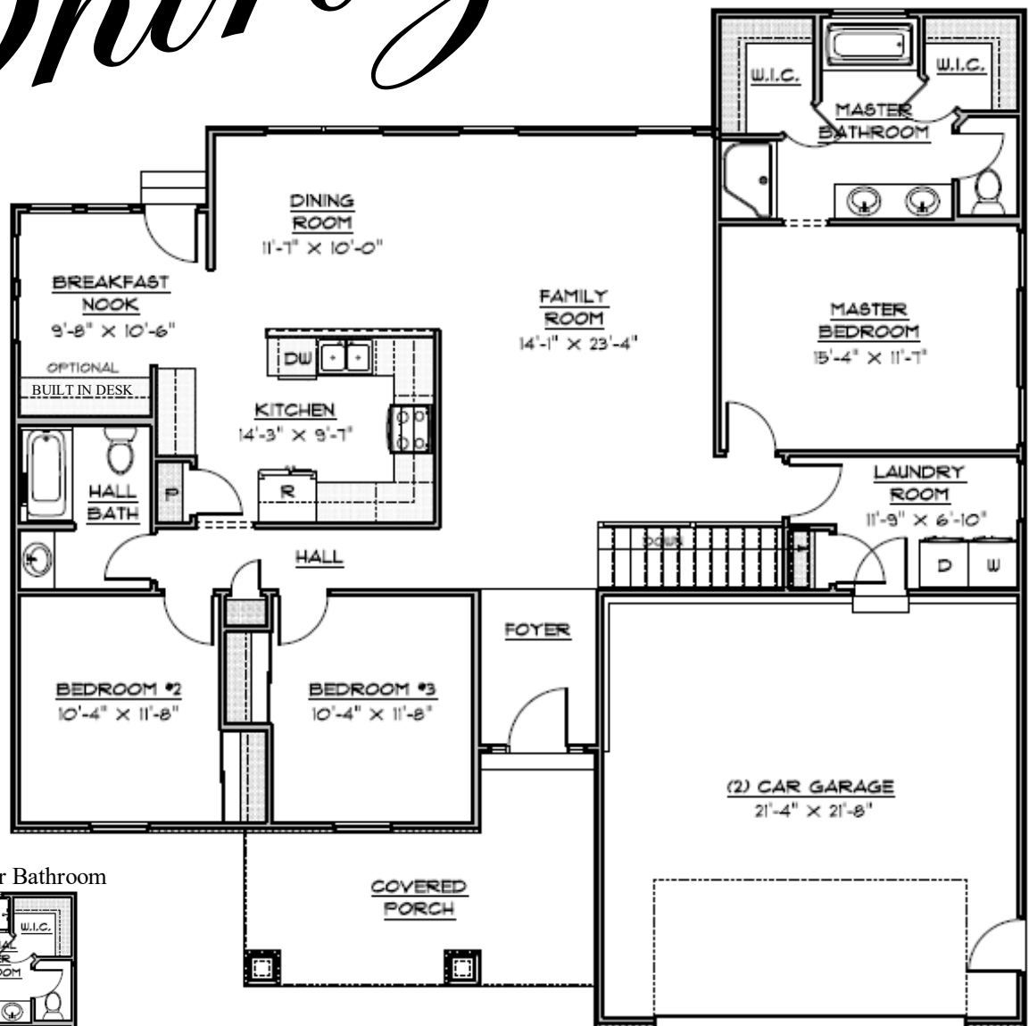
Optional Master Bathroom